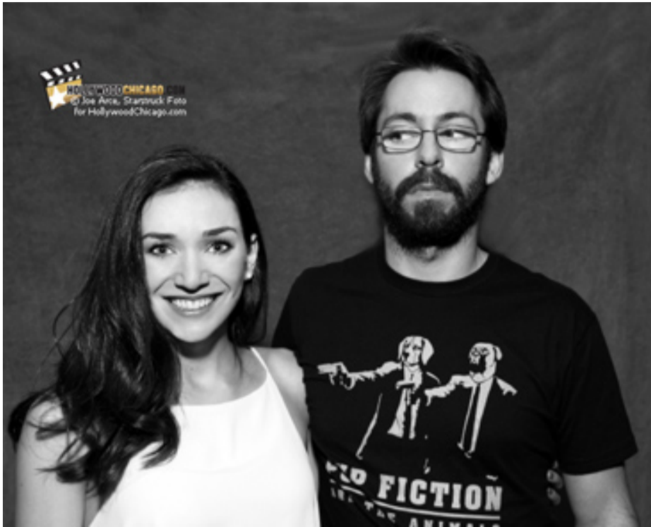
Jocelyn DeBoer, Martin Starr at the Chicago Critics Film Festival

HollywoodChicago.com interviewed Martin Starr on the Red Carpet at the Chicago Critics Film Festival. The Fest goes on until May 15th, 2014, with a full state of closing night films – including “Animals,” a film locally produced and set-in-Chicago. For more details, click here . [19]