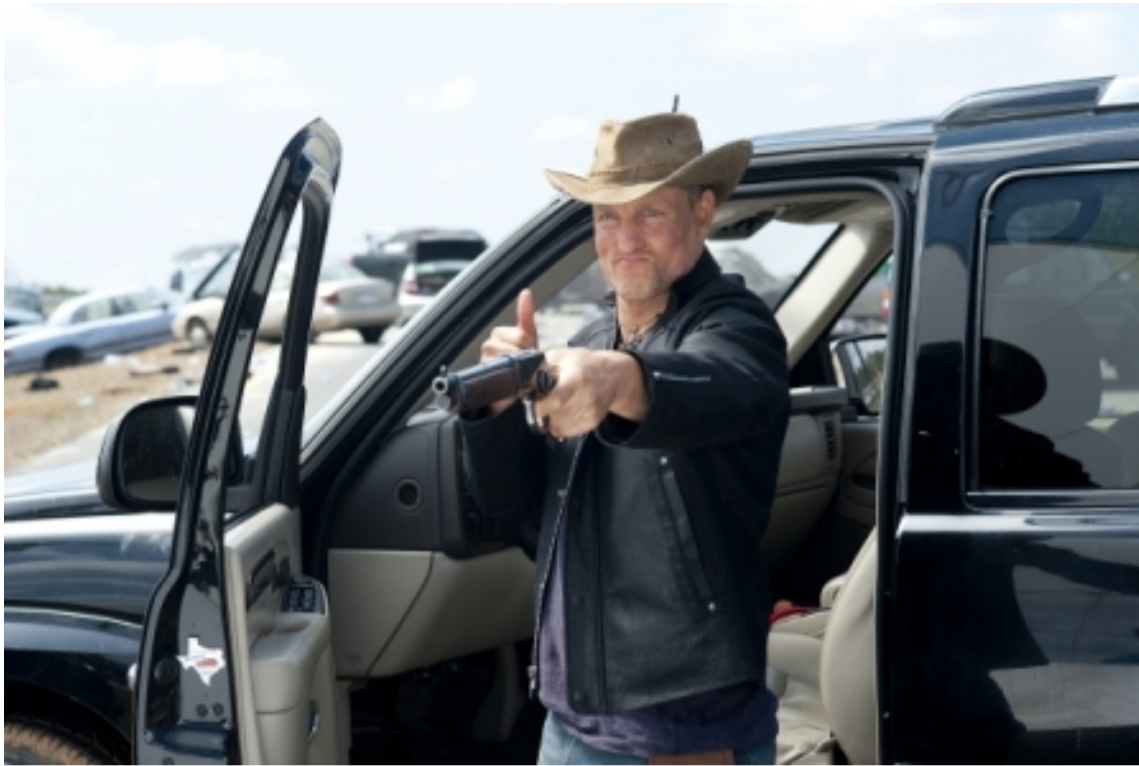
Woody Harrelson stars in Columbia Pictures' comedy ZOMBIELAND.

Even the trend for apocalypse films - "Zombieland," "2012," "The Road" - came up. Harrelson says, "I think that there is a real sense in our culture that we are heading towards some kind of apocalypse—maybe it is part of the Christian concept of the apocalypse but I am not saying that is an exclusively Christian concept. Maybe that is one of the things that make people resonate with these apocalyptic movies. I did this junket for 2012 and people kept asking me if I really thought that it was going to go in 2012 in the way that it seems to be going and I said that ecologically, we seemed to be right on target. I am really concerned with that because we are moving towards a very difficult time. Under Bush, we had eight years that were rough in every way, not the least was the assault on Mother Nature. However, I am not loving Obama—he made this statement when they were talking about trying to accomplish with the new legislation about global warming and he said "Let's not let great be the enemy of good." That just stayed with me and haunted me. "Great be the enemy of good"—let's not make great, firm international legislation and try to settle for what we can get. LBJ probably would have said that."