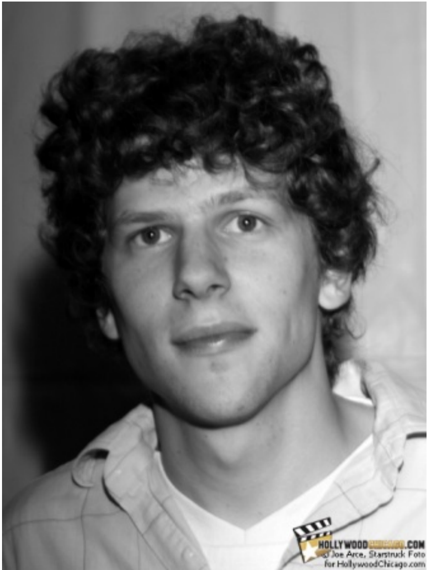
Jesse Eisenberg at the Chicago premiere of Zombieland, Sept. 28th, 2009.