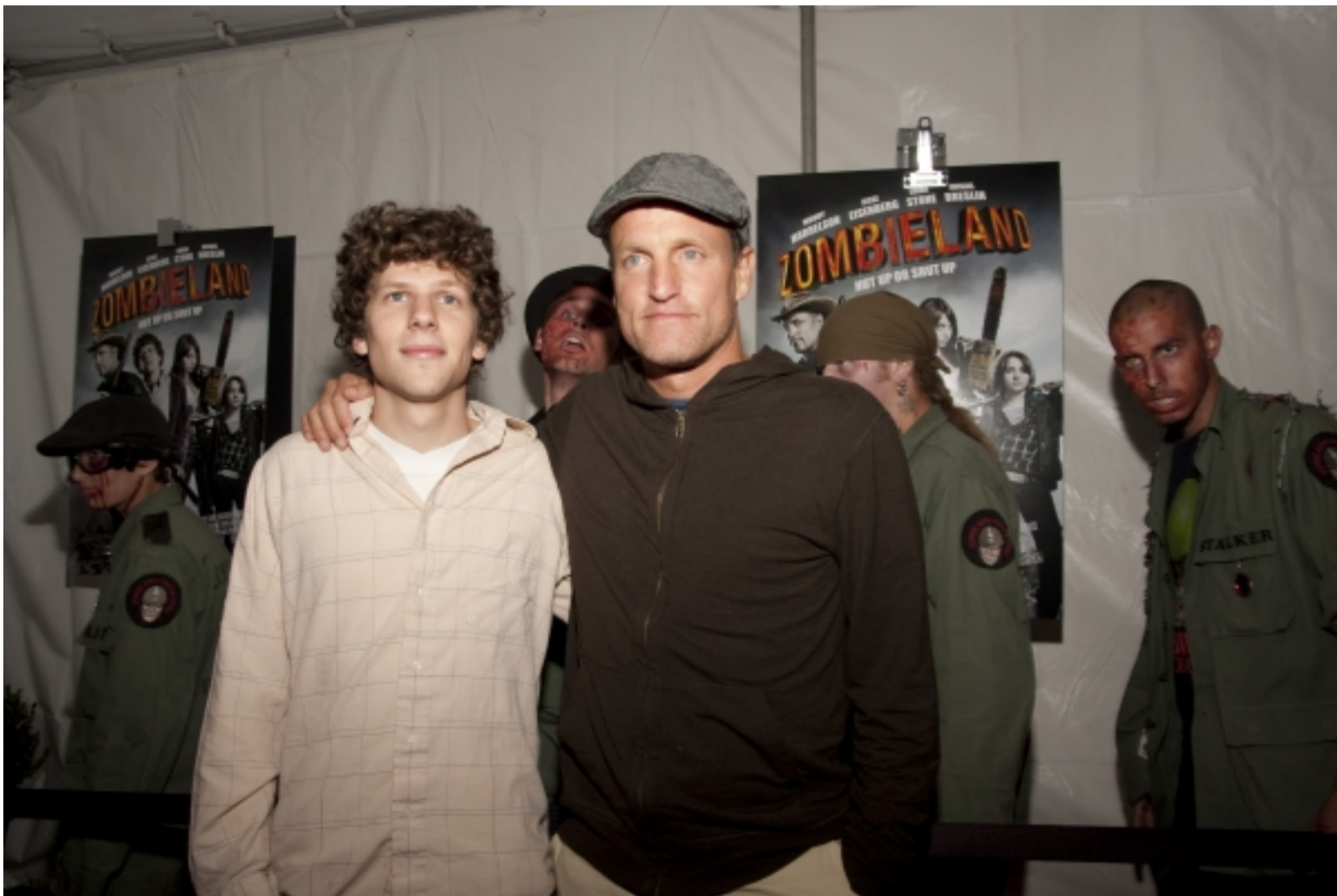
Jesse Eisenberg and Woody Harrelson at the AMC River East Red Carpet Screening of Columbia Pictures' horror comedy ZOMBIELAND.

Harrelson and Eisenberg star as Tallahassee and Columbus, respectively. Harrelson’s the alpha male and Eisenberg the neurotic follower and both are just trying to stay alive in a future where there are more undead than alive. The film is filled with increasingly over-the-top zombie deaths, but it’s the characters that will truly turn it into a cult classic, something that surprised the film’s stars.