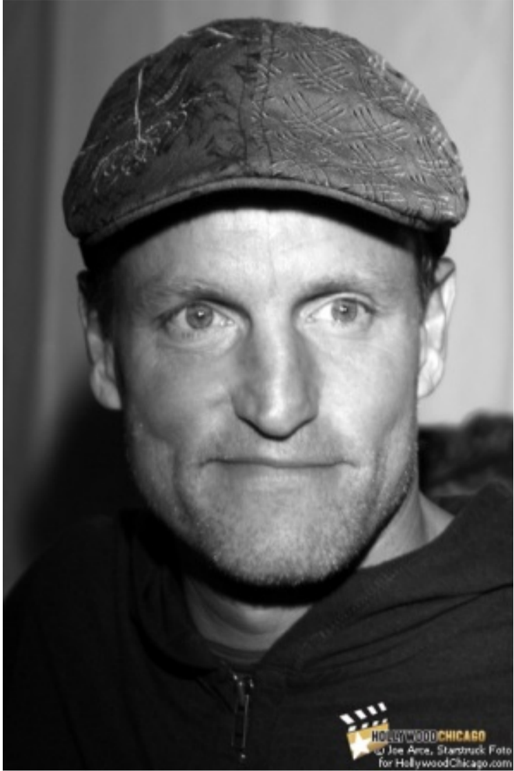
Woody Harrelson still scanning the red carpet perimeters for potential zombies at the Chicago premiere of "Zombieland" Sept. 28th 2009.